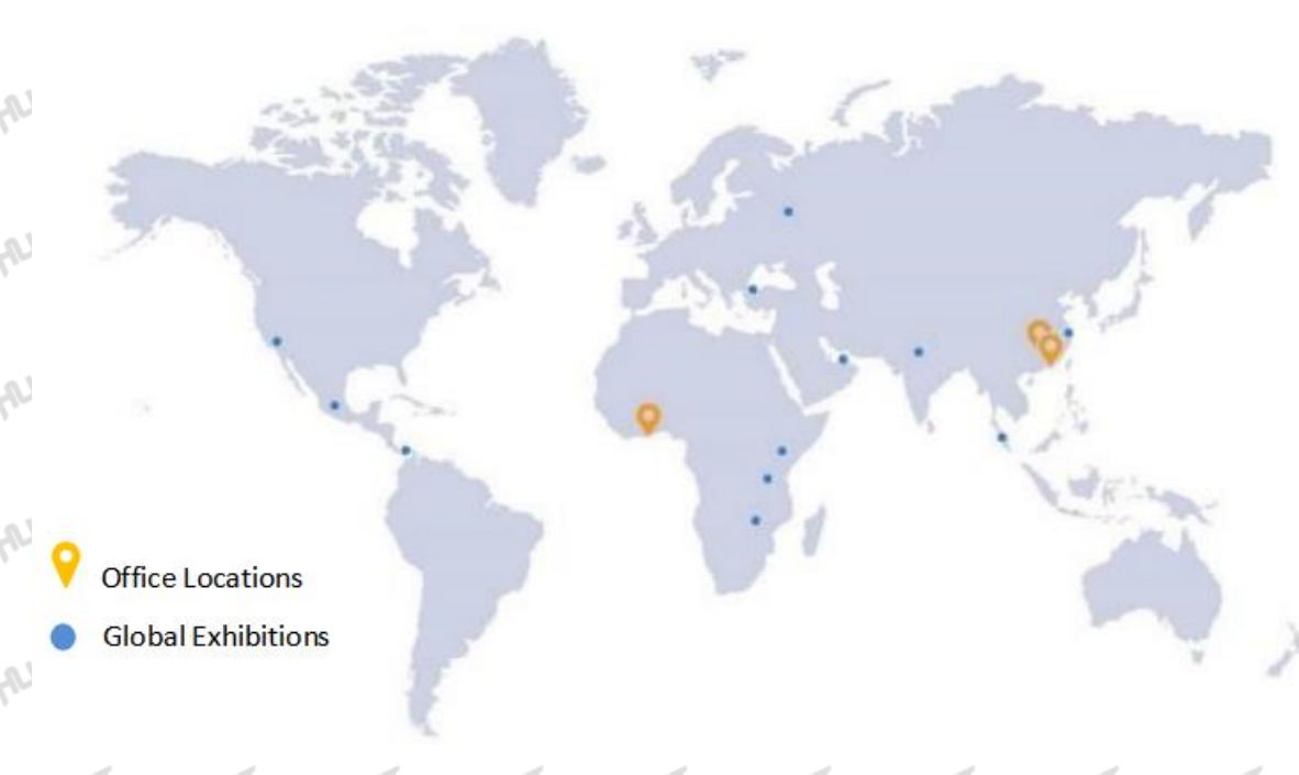
Pic No. 7