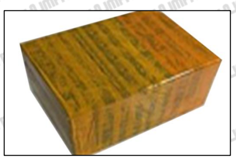
Pic No. 5 International Express Packaging: Wrapped with yellow tape after wrapping black protective film