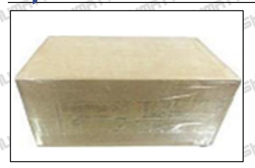
Pic No. 4 Domestic Express Packaging: Wrapped with transparent tape