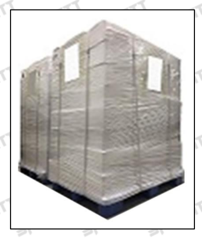
Pic No. 6